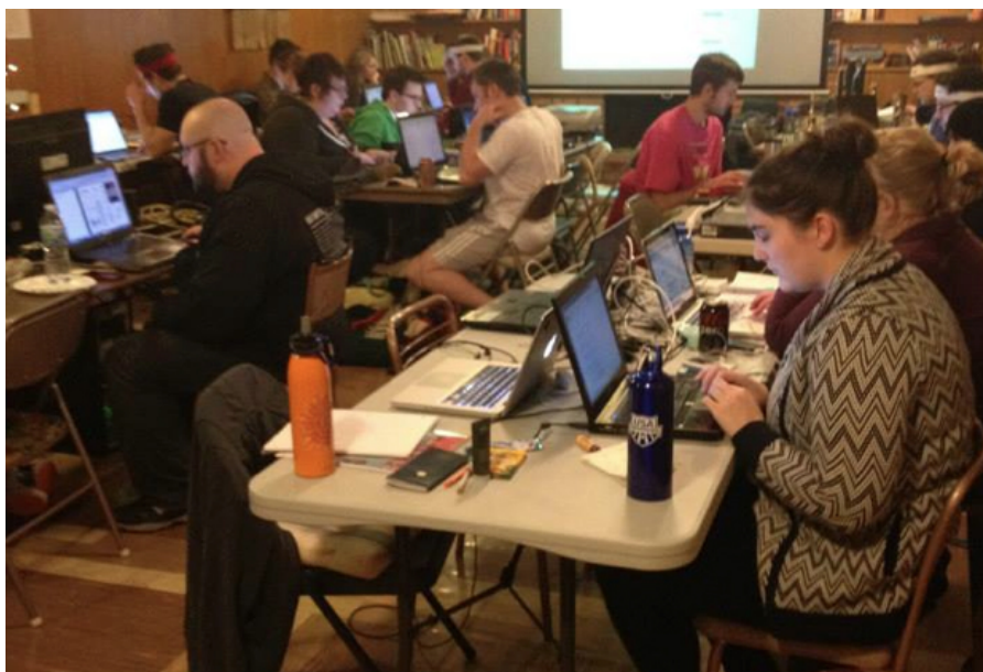
Winning 2014 team: "Stefans Dream XV: Pardon the Eruption"

ST. CLOUD — It's one of the largest trivia contests in the world. St. Cloud State University's college and community radio station, KVSC 88.1FM is hosting its 38th annual Trivia Weekend.